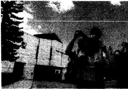
Benguet General Hospital