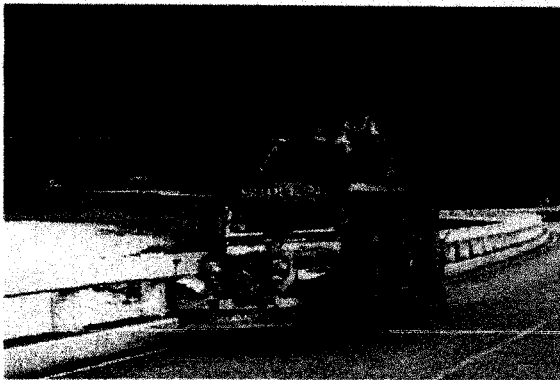
Patapat Viaduct in Ilocos Norte

For more information on JICA and its activities in Northern Luzon, please visit: https://www.jica.go.jp/philippine/english/ (In the search engine you may type the name of the province to see related projects)