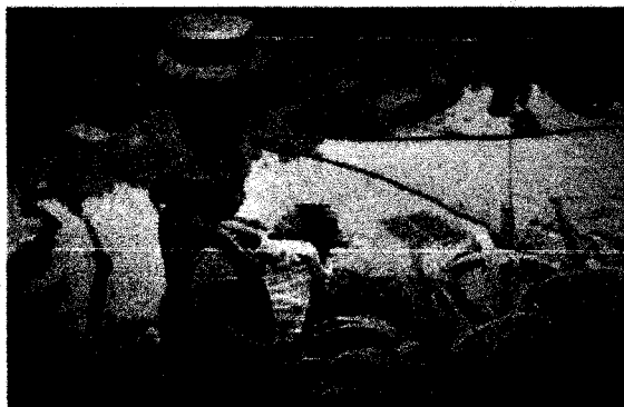
Maternal and Child Health in Cordillera