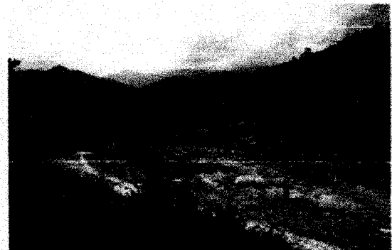
Laoag Flood Control