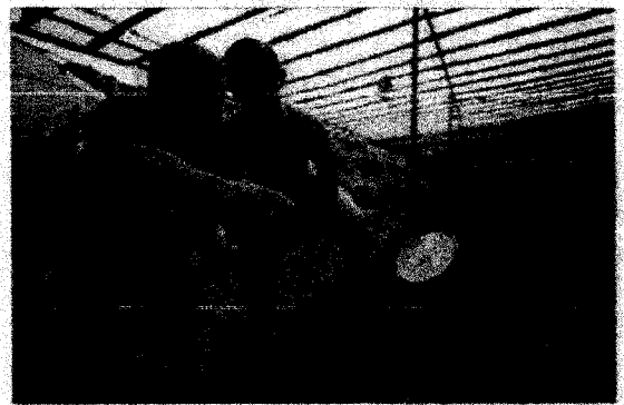
Safe vegetables farming in Benguet