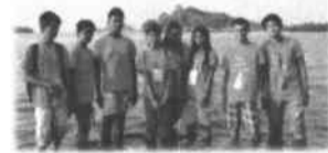
2013 BYLI SOCIAL SCIENCE CAMP